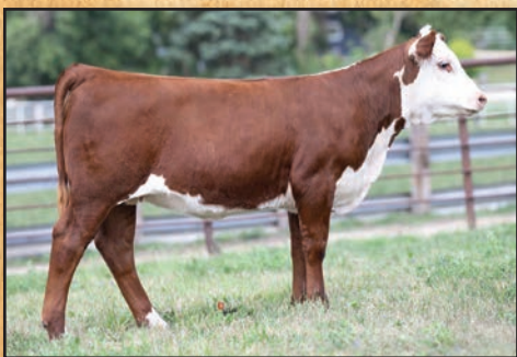
JDH AH 8032 MS LINCOLN 125L ET - 44458183