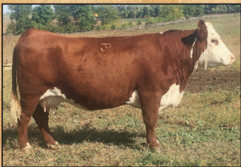
UPS MISS SENSATION 3785 ET - 43463398