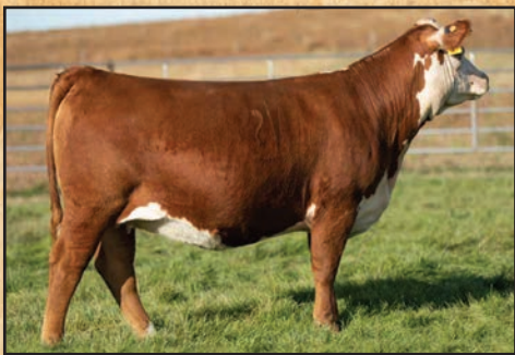
H SOUTHERN BELL 2223 ET - 44369835