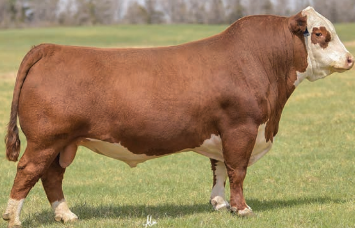
SR EXPEDITION 619G ET