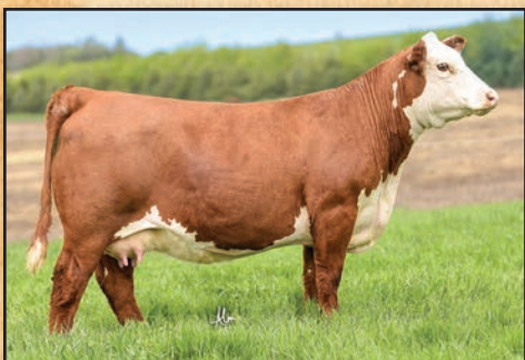
SR DOMITA 1104J ET - 44265767